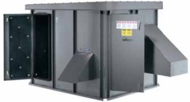
Rx (ERV) Module

One to two LEED points are available for systems that promote occupancy comfort, well being, and productivity. ClimateMaster's Rx ERV module provides a very cost-effective method for bringing in outside air through the use of energy recovery technology. In addition, up to 70% of the energy can be recovered from the building's exhaust air, saving 3 tons of equipment capacity for every 1,000 cfm of outside air. Smaller equipment directly impacts building life cycle costs and lowers up-front installation costs.