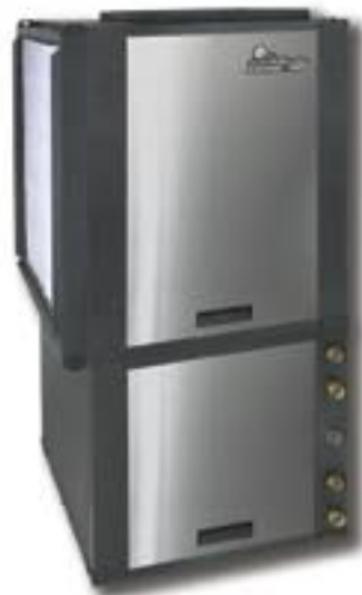
Tranquility 27™ Unit

What can you do to protect your family from this costly trend? Reduce your consumption of energy. You can improve your home's "energy efficiency" with improved appliances, more insulation, and newer or fewer windows... but, did you know that over 50% of your utility costs come from heating, cooling, and water heating? Now, that's something you can control... it's called the Tranquility 27™ geothermal system from ClimateMaster.